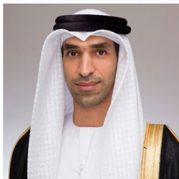
His Excellency Dr Thani bin Ahmed Al Zeyoudi Minister of State for Foreign Trade