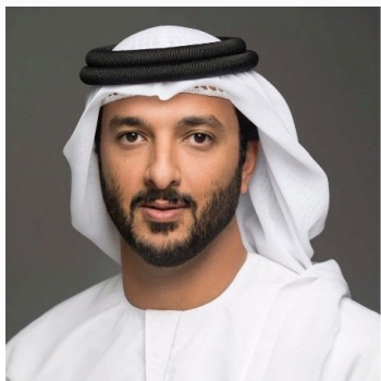
His Excellency Abdullah bin Touq UAE Minister of Economy