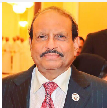
Yusuff Ali Musaliam Chairman of Lulu Group