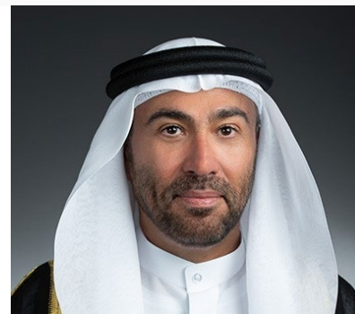
His Excellency Ahmed bin Ali Al Sayegh Minister of State,