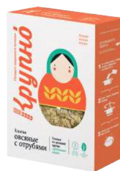
Selected bran oat flakes Require boiling Weight: 400 g Shelf life: 12 months