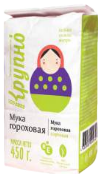
Selected pea meal Weight: 450 g Shelf life: 12 months