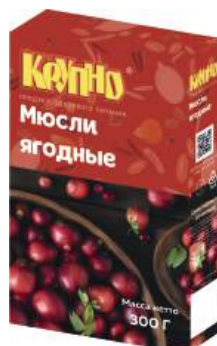
Berry muesli Weight: 300 g Срок годности: 10 months Ingredients: oat flakes, wheat flakes, raisin, barley flakes, corn flakes, cranberry, strawberry, sunflower seeds, rye flakes