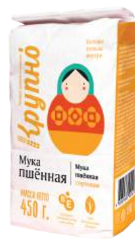
Selected millet meal Weight: 450 g Shelf life: 6 months