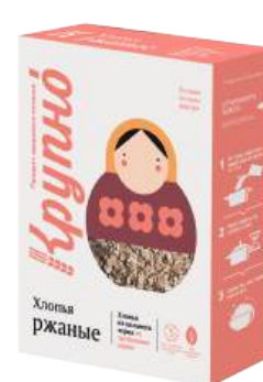
Selected rye flakes No boiling Weight: 400 g Shelf life: 12 months