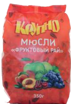
Muesli "Fruktovyy Ray" Weight: 350 g Shelf life: 10 months Ingredients: oat flakes, wheat flakes, barley flakes, corn flakes, raisin, apricot, sunflower seeds, cherry, rye flakes, apple