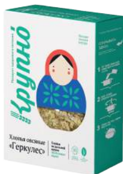
High-quality oat flakes «Hercules» Require boiling Weight: 400 g Shelf life: 12 months