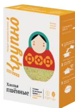
Selected millet flakes No boiling Weight: 400 g Shelf life: 9 months