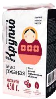
Selected rye flour Weight: 450 g Shelf life: 6 months