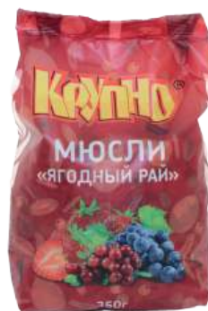
Muesli "Yagodnyy Ray" Weight: 350 g Shelf life: 10 months Ingredients: oat flakes, wheat flakes, raisin, barley flakes, corn flakes, cranberry, strawberry, sunflower seeds, rye flakes