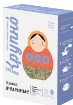
Selected barley flakes No boiling Weight: 400 g Shelf life: 12 months