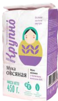
Selected oat flour Weight: 450 g Shelf life: 6 months