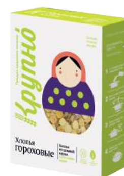
Selected pea flakes Require boiling Weight: 400 g Shelf life: 12 months