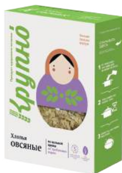
Selected oat flakes No boiling Weight: 400 g Shelf life: 12 months