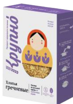
Selected buckwheat flakes No boiling Weight: 400 g Shelf life: 12 months