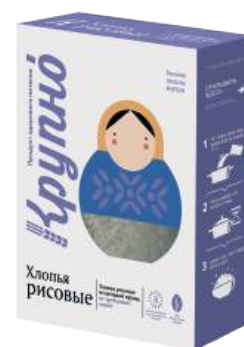
Selected rice flakes No boiling Weight: 400 g Shelf life: 9 months