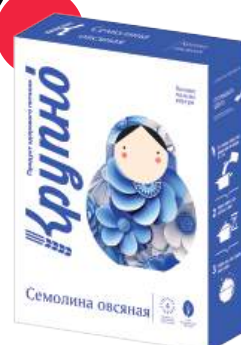
Oat semolina Require boiling Weight: 200 g Shelf life: 6 months