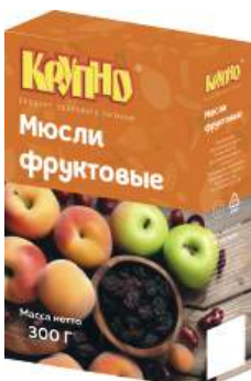
Fruit muesli Weight: 300 g Срок годности: 10 months Ingredients: oat flakes, wheat flakes, barley flakes, corn flakes, raisin, apricot, sunflower seeds, cherry, rye flakes, apple