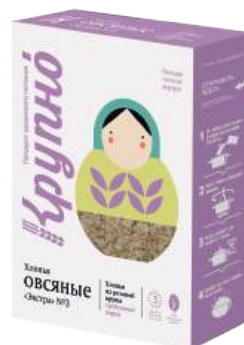
High-quality oat flakes Extra No. 3 Require boiling Weight: 400 g Shelf life: 12 months