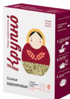
Selected wheat flakes No boiling Weight: 400 g Shelf life: 12 months