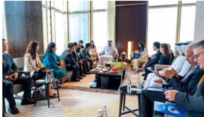
His Highness Sheikh Saud bin Saqr Al Qasimi in Guangzhou, NOV 2024