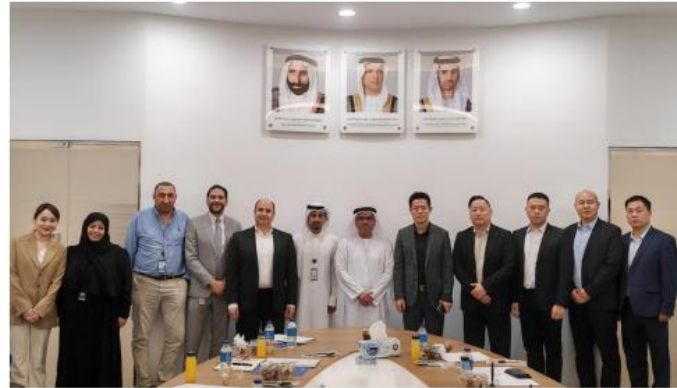
RAK Public Service Department, FEB 2025