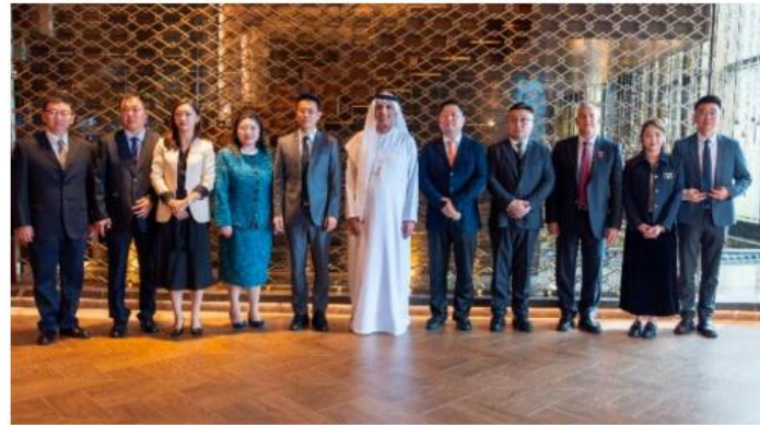
QiaoYin Team with RAK Chief, NOV 2024