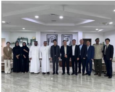
RAK EPDA, FEB 2025