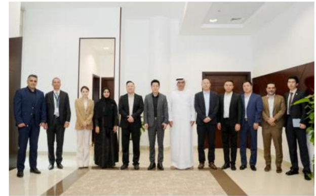
RAK Municipality, FEB 2025