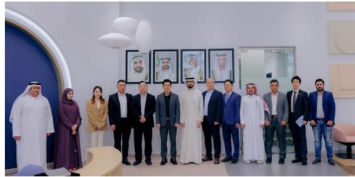
RAK Transport Authority, FEB 2025