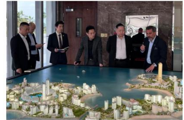
RAK Marjan, FEB 2025