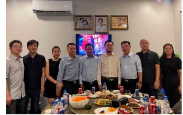
Phnom Penh, NOV 2024