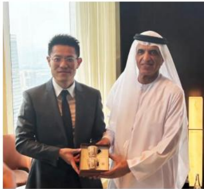
RAK Chief, NOV 2024