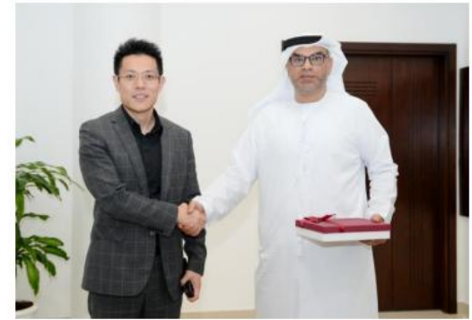
RAK Municipality, FEB 2025