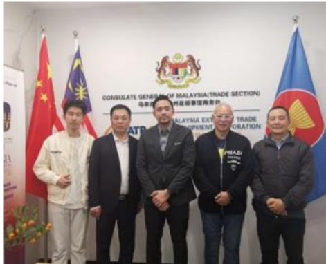
Consulate General of Malaysia , JAN 2025