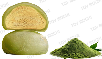
TÉ VERDE MATCHA